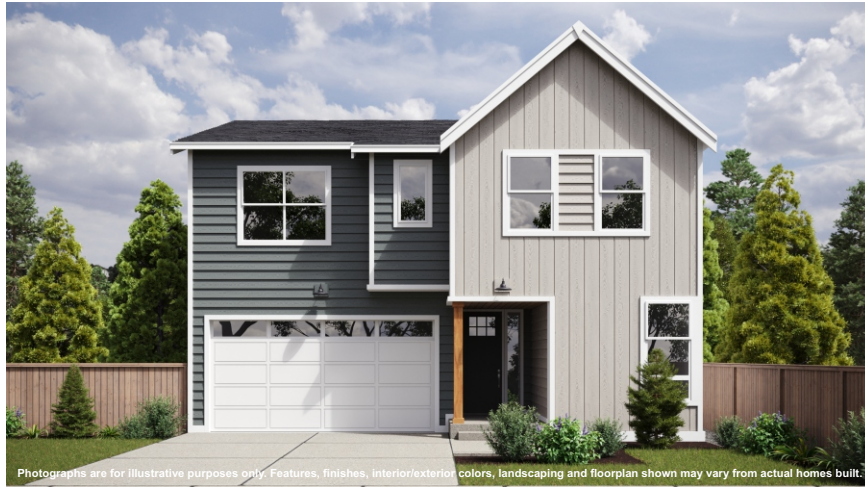
Photographs are for illustrative purposes only. Features, finishes, interior/exterior colors, landscaping and floorplan shown may vary from actual homes built.