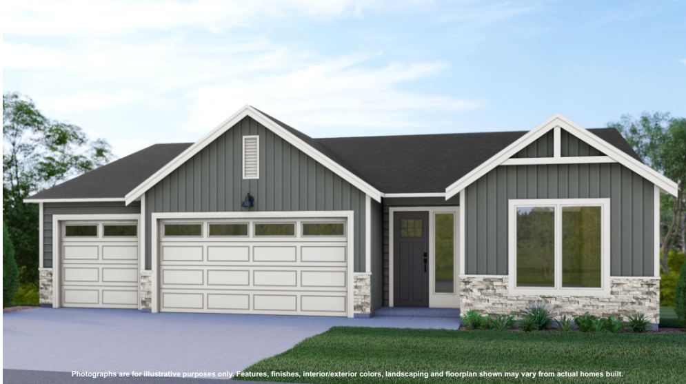
Photographs are for illustrative purposes only. Features, finishes, interior/exterior colors, landscaping and floorplan shown may vary from actual homes built.