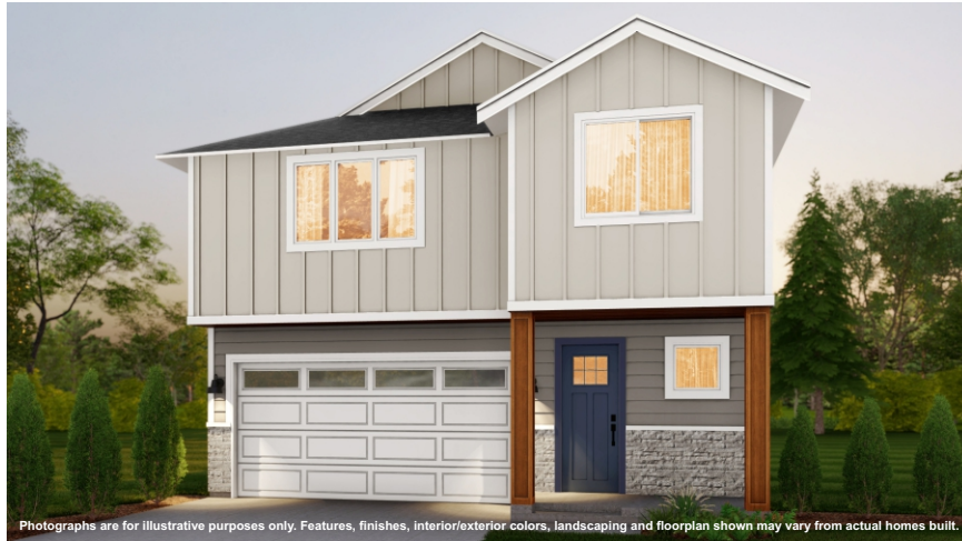
Photographs are for illustrative purposes only. Features, finishes, interior/exterior colors, landscaping and floorplan shown may vary from actual homes built.