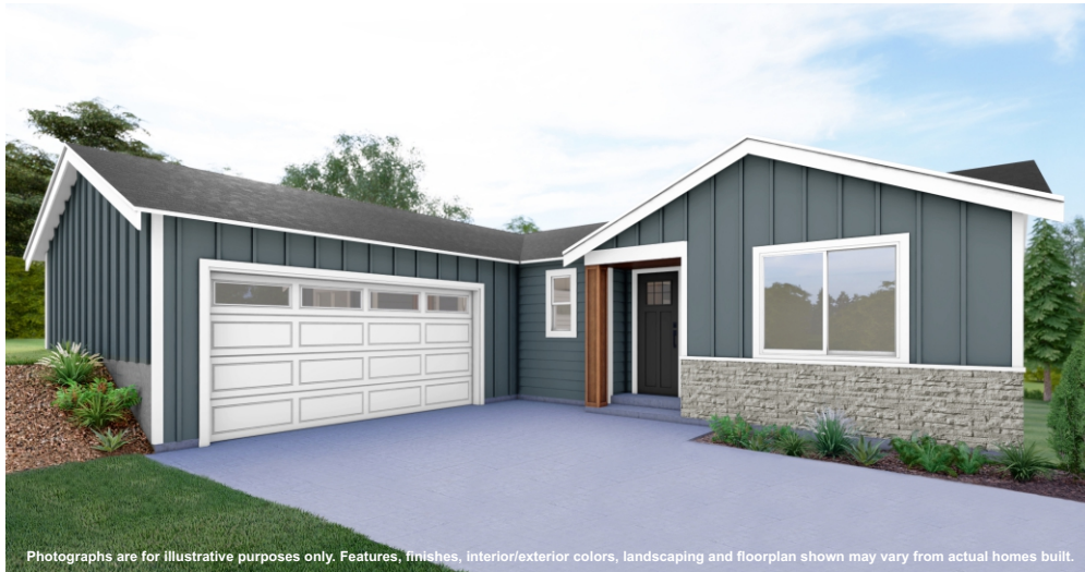
Photographs are for illustrative purposes only. Features, finishes, interior/exterior colors, landscaping and floorplan shown may vary from actual homes built.