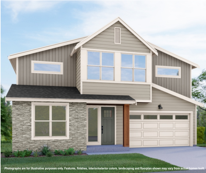
Photographs are for illustrative purposes only. Features, finishes, interior/exterior colors, landscaping and floorplan shown may vary from actual homes built.