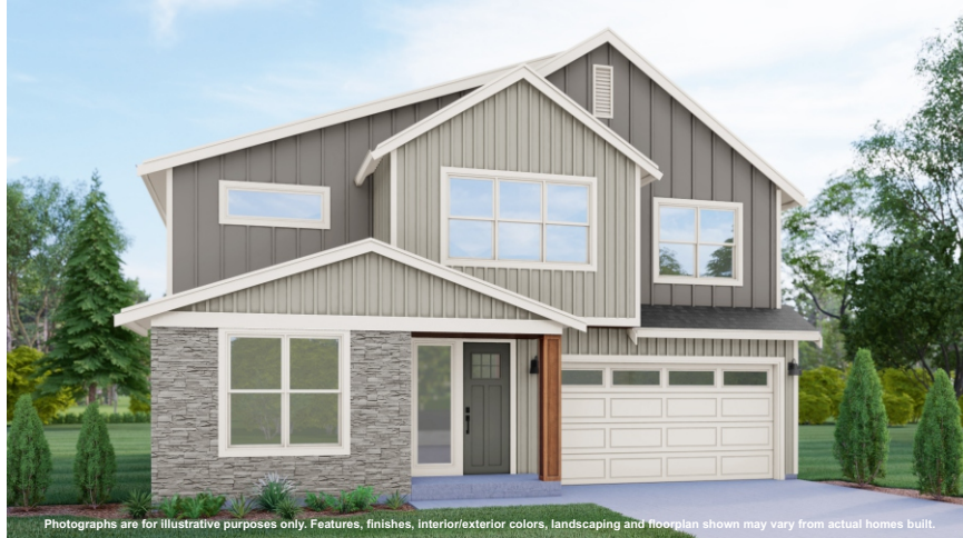
Photographs are for illustrative purposes only. Features, finishes, interior/exterior colors, landscaping and floorplan shown may vary from actual homes built.