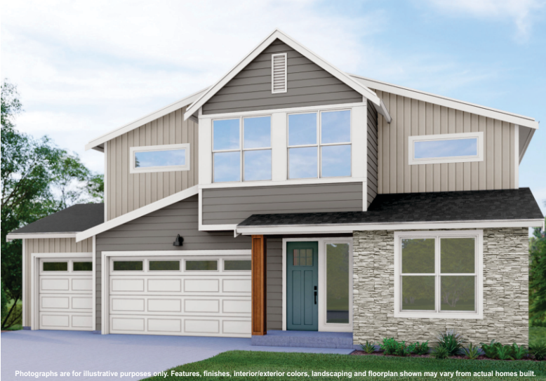
Photographs are for illustrative purposes only. Features, finishes, interior/exterior colors, landscaping and floorplan shown may vary from actual homes built.