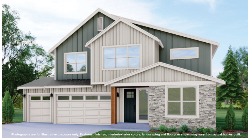
Photographs are for illustrative purposes only. Features, finishes, interior/exterior colors, landscaping and floorplan shown may vary from actual homes built.