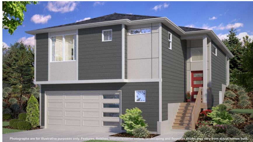
Photographs are for illustrative purposes only. Features, finishes, interior/exterior colors, landscaping and floorplan shown may vary from actual homes built.