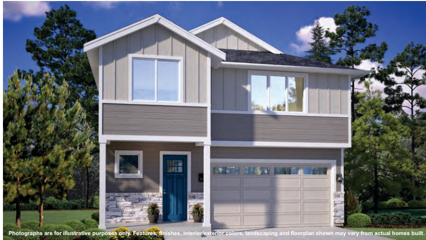
Photographs are for illustrative purposes only. Features, finishes, interior/exterior colors, landscaping and floorplan shown may vary from actual homes built.