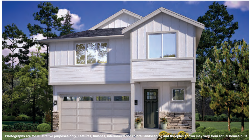
Photographs are for illustrative purposes only. Features, finishes, interior/exterior colors, landscaping and floorplan shown may vary from actual homes built.