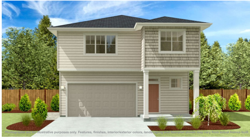
Architectural rendering for illustrative purposes only. Features, finishes, interior/exterior colors, landscaping, and furniture shown may vary from actual home built.