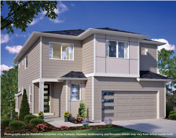
Photographs are for illustrative purposes only. Features, finishes, landscaping and floorplan shown may vary from actual homes built.