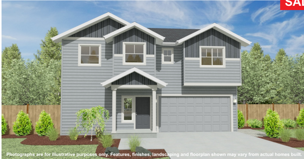
Photographs are for illustrative purposes only. Features, finishes, landscaping and floorplan shown may vary from actual homes built.