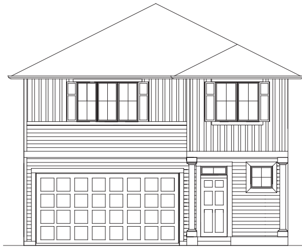
Above Elevation not representative of actual home. Actual Elevation TBD.