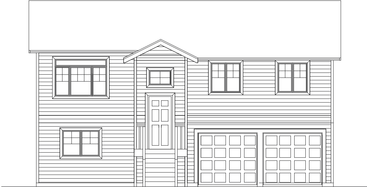
Above Elevation not representative of actual home. Actual Elevation TBD.