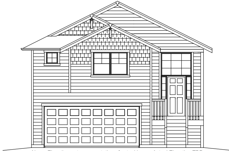
Above Elevation not representative of actual home. Actual Elevation TBD.