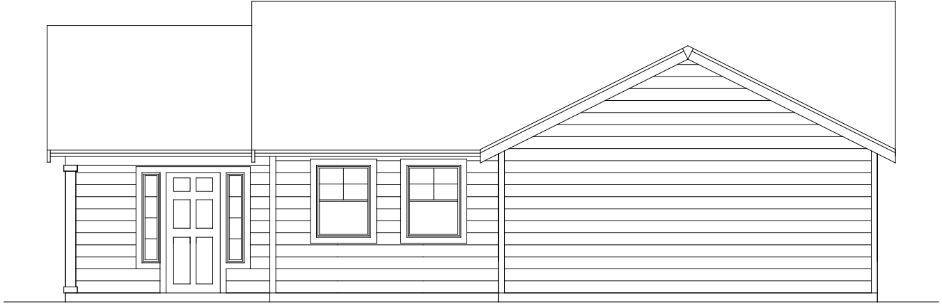
Above Elevation not representative of actual home. Actual Elevation TBD.