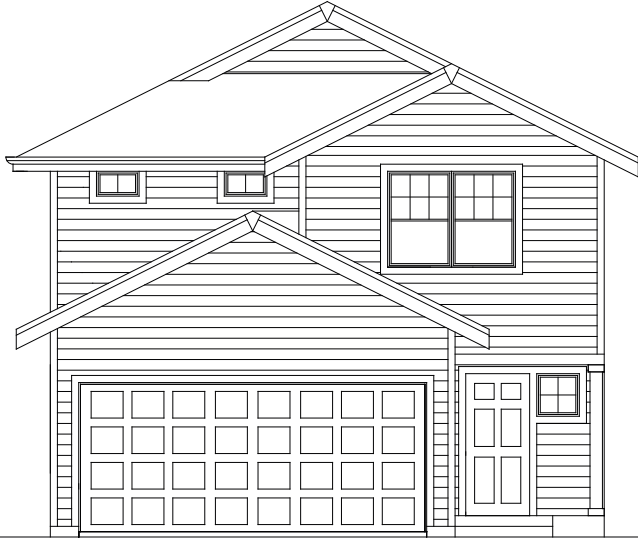
Above Elevation not representative of actual home. Actual Elevation TBD.