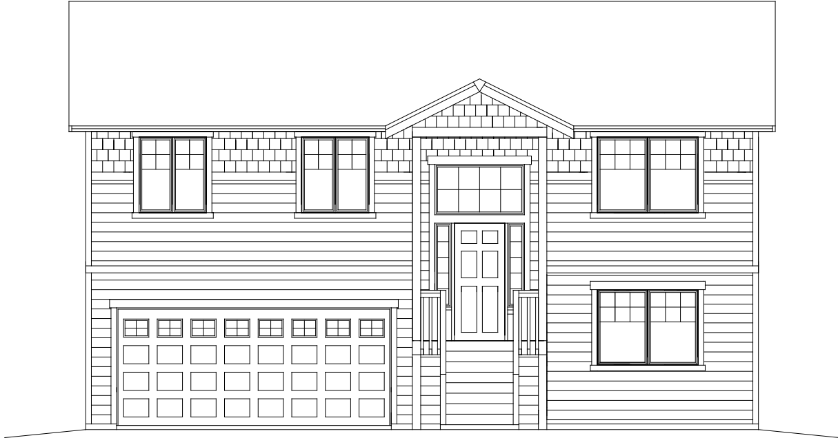
Above Elevation not representative of actual home. Actual Elevation TBD.