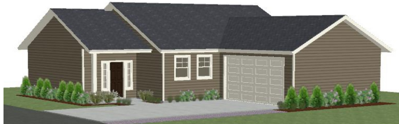
Above Elevation not representative of actual home. Photographs are for illustrative purposes only. Features, finishes and floorplan shown may vary from actual homes built.