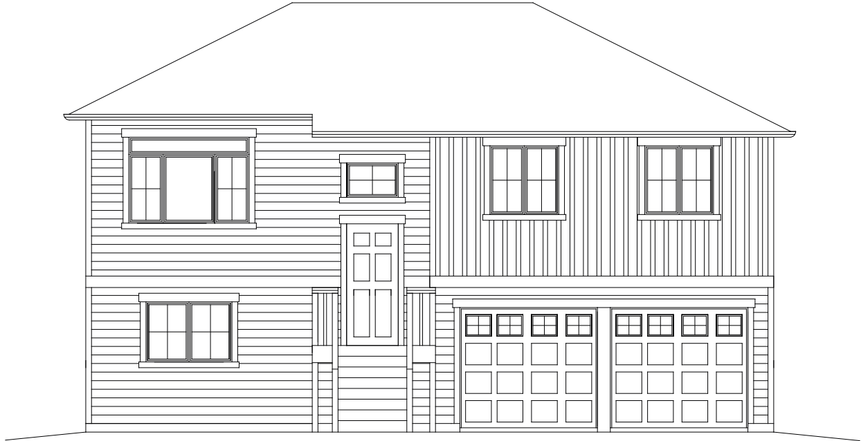
Above Elevation not representative of actual home. Actual Elevation TBD.