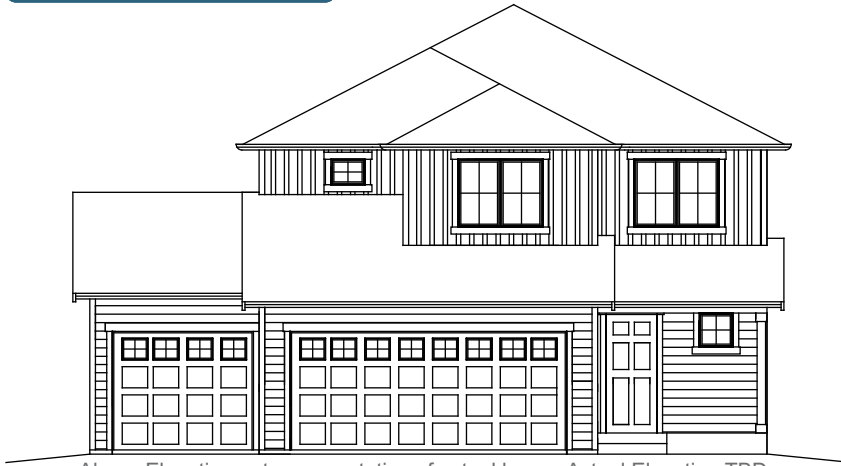
Above Elevation not representative of actual home. Actual Elevation TBD.