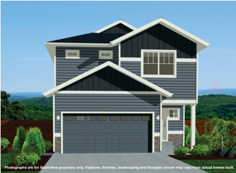
Photographs are for illustrative purposes only. Features, finishes, landscaping and floorplan shown may vary from actual homes built.