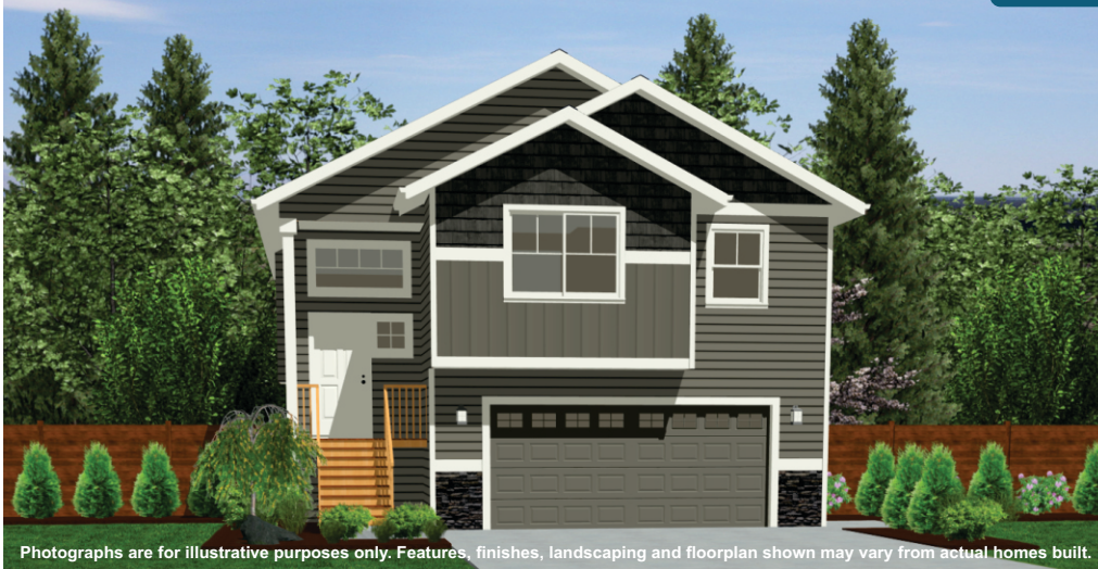
Photographs are for illustrative purposes only. Features, finishes, landscaping and floorplan shown may vary from actual homes built.