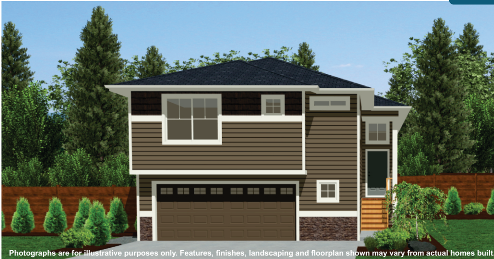
Photographs are for illustrative purposes only. Features, finishes, landscaping and floorplan shown may vary from actual homes built.